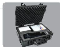
Includes Hard Case