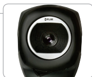
Focus-free Lens for Point-and-Shoot Simplicity