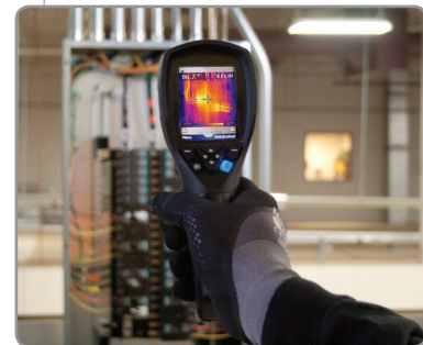
Find Hot Spots Fast!