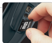
Removable SD Card and USB Output for Fast Image Downloads