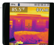
Excellent 2.8" Color LCD Shows the Whole Scene